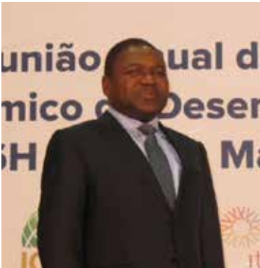
H.E. Filipe Nyusi, President of the Republic of Mozambique

They teach our states and institutions lessons that can be showcased in the international dialogue preceding the adoption of development goals in New York next autumn. Of those lessons I want to particularly mention building of the economy on three pillars: