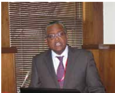
H.E. Omar Mitha, Vice Minister of Industry and Trade, Mozambique